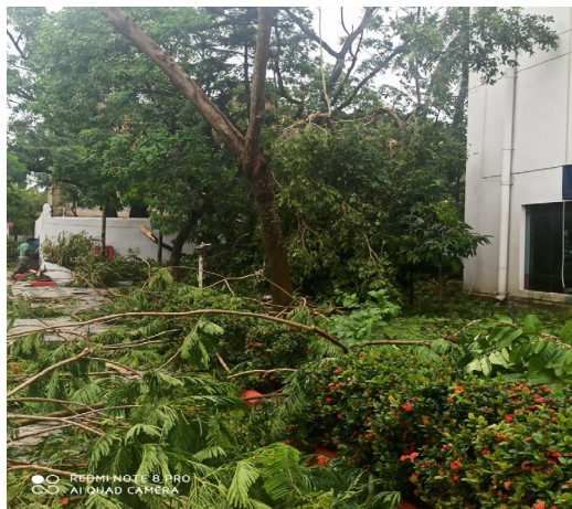
Amphan effect at Brainware Campus, Barasat